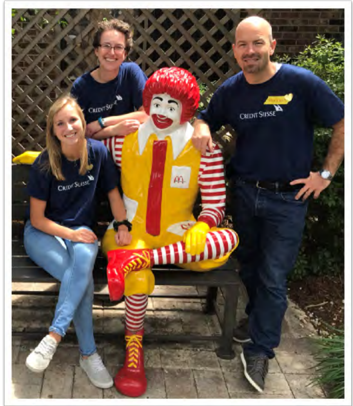
Credit Suisse joined the House Heroes in 2019.