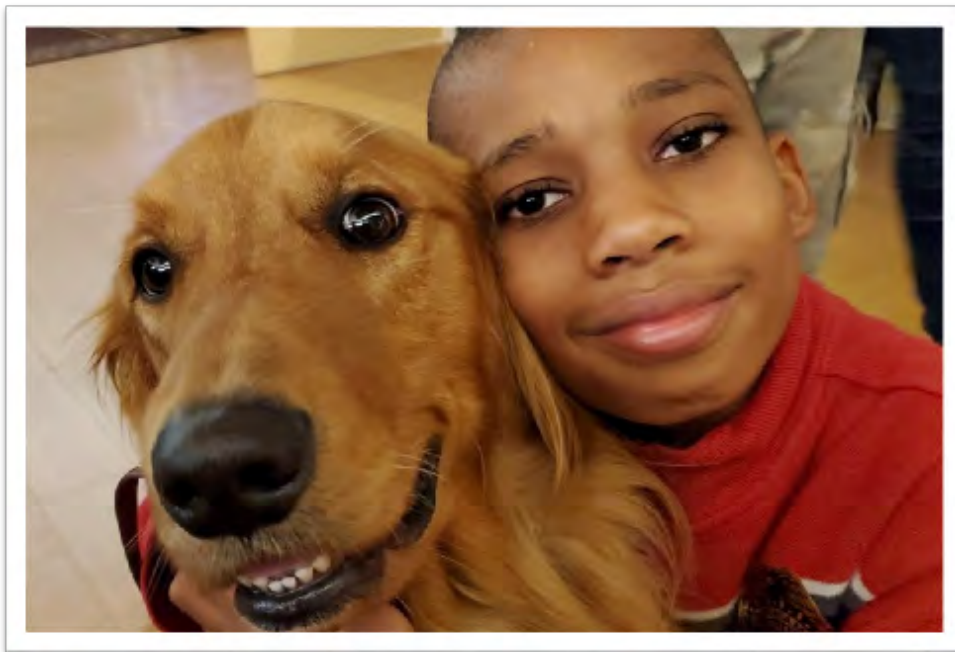
Therapy dogs bring joy and comfort to sick children and their families.